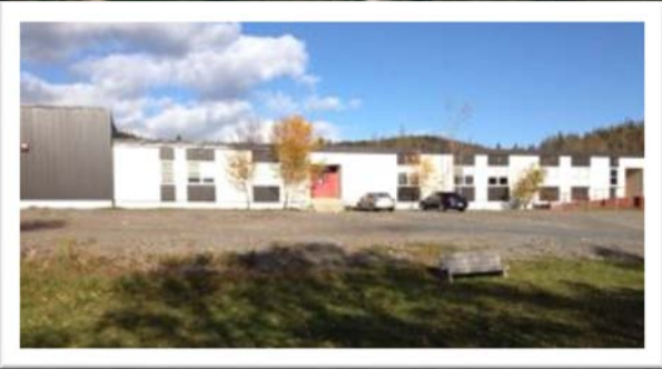
Swift Current Academy