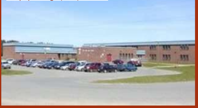
Holy Spirit High (9-12)