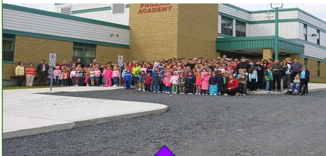
Phoenix Academy (K-12)