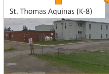
St. Thomas Aquinas (K-8)