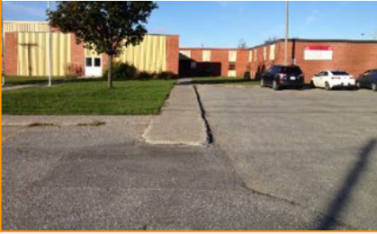
Pathfinder Learning Centre (10-12)