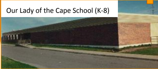
Our Lady of the Cape School (K-8)